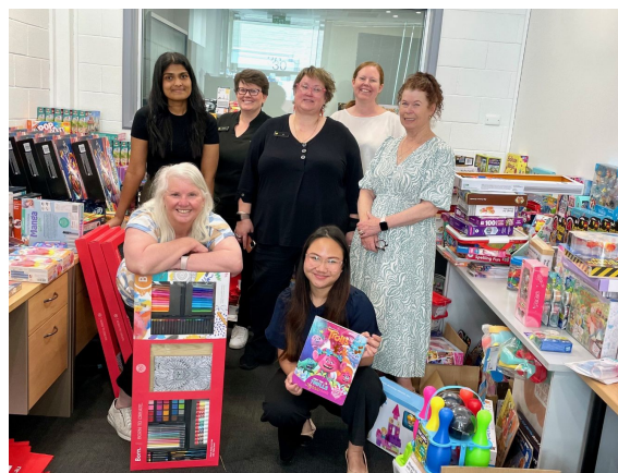
Commonwealth Bank and Grandcarers SA team members pause whilst sorting gifts.